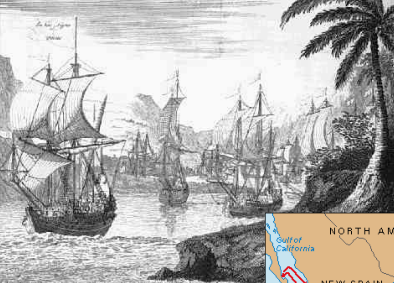
Hernan Cortes from Spain 1521

Conquered Tenochtitlan Renamed Mexico City